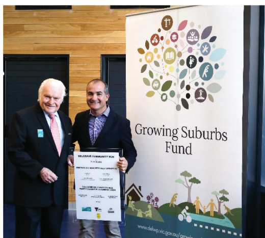
Completed: Destination Rosebud Gateway Sculpture, Mornington Peninsula Shire Council