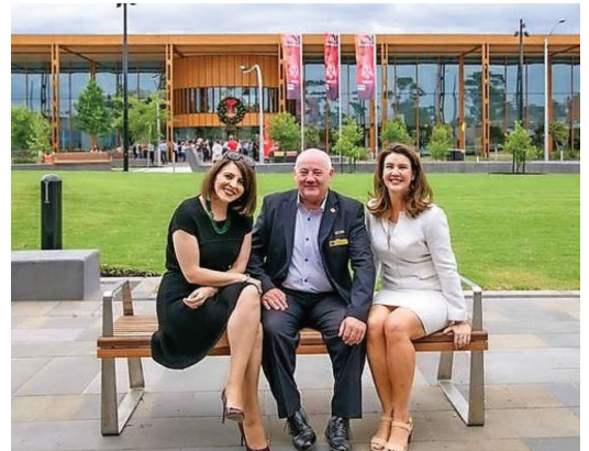
Completed. Pride of Melton, Melton City Council