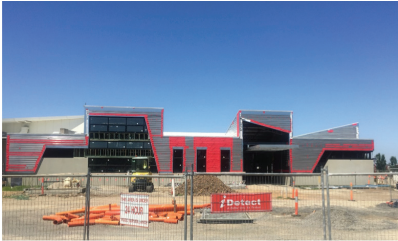
Under construction: Cardinia Cultural Centre, Cardinia Shire Council