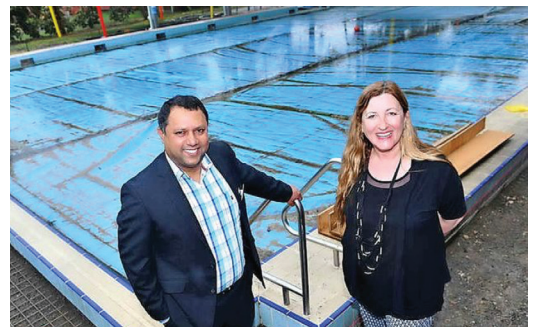
Under Construction: Whittlesea Swim Centre refurbishment, City of Whittlesea