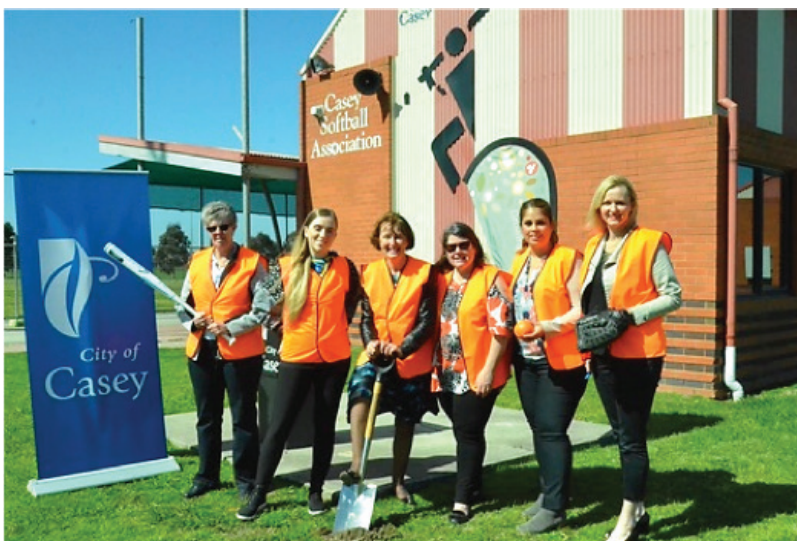
Under Construction: - Sweeney Reserve Softball Pavilion redevelopment, City of Casey Council