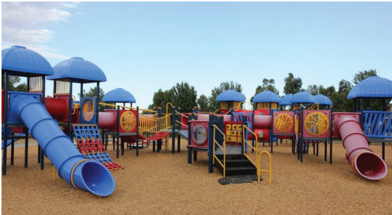
Under Construction: Galaxyland Playspace redevelopment, Hume City Council