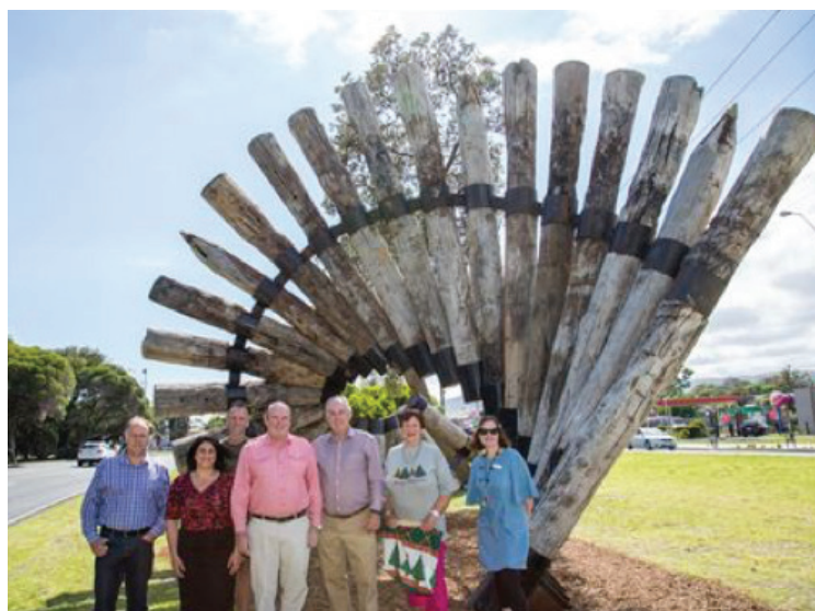
Completed: Belgrave Community Hub, Yarra Ranges Shire Council