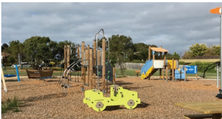
Completed: Oakridge Reserve, Mornington Peninsula Shire Council