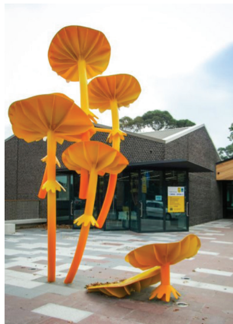
Completed: Belgrave Community Hub, Yarra Ranges Shire Council