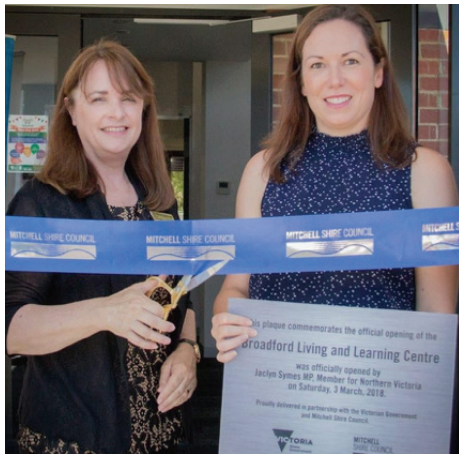
Completed: Broadford Living and Learning Centre, Mitchell Shire Council