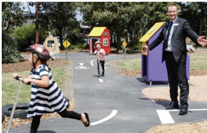
Completed: PB Ronald Reserve, Cardinia Shire Council