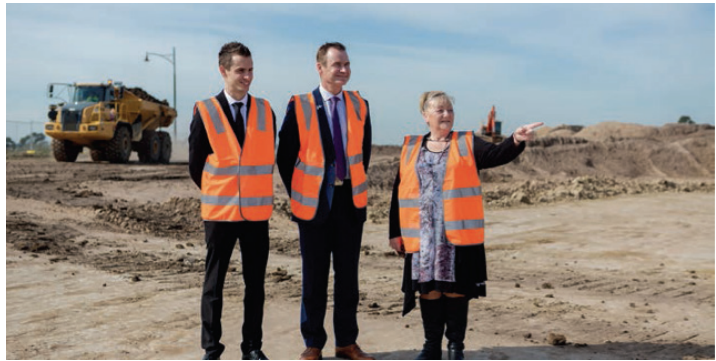
In Progress: James Bathe Reserve, Cardinia Shire Council