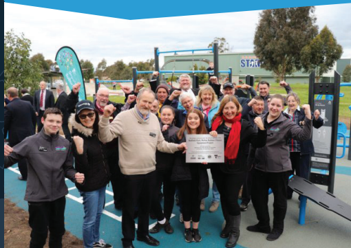
Outdoor fitness facilities – Mitchell Shire Council

HOW MANY PROJECTS BUILT COMMUNITY CAPACITY?